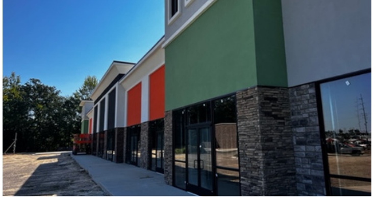
BUILDING 1 | EXTERIOR