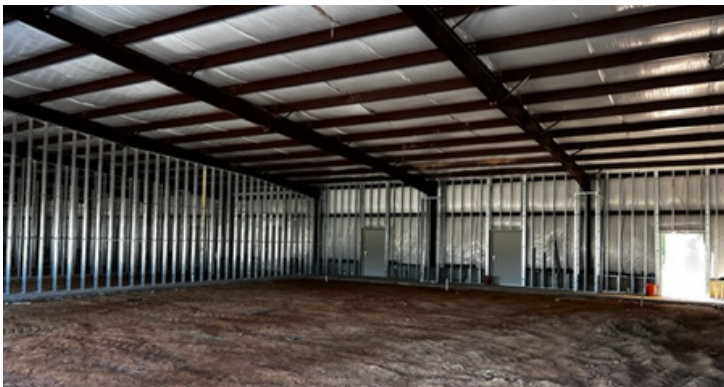
BUILDING 1 | INTERIOR