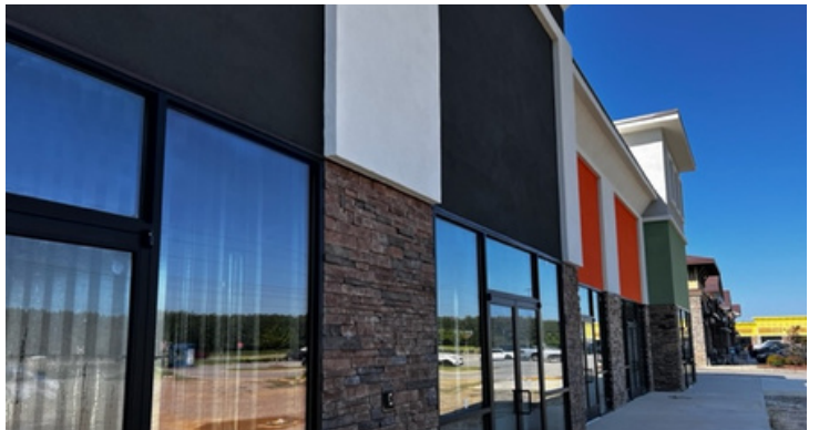
BUILDING 1 | EXTERIOR