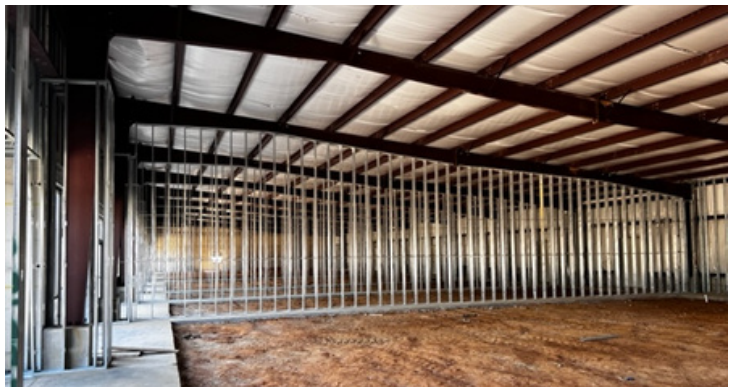
BUILDING 1 | INTERIOR

GEORGE MANLEY NC BROKER C: 910.603.8395 GEORGE@CSGNC.COM