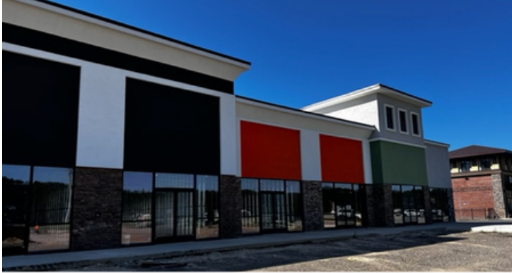
BUILDING 1 | EXTERIOR