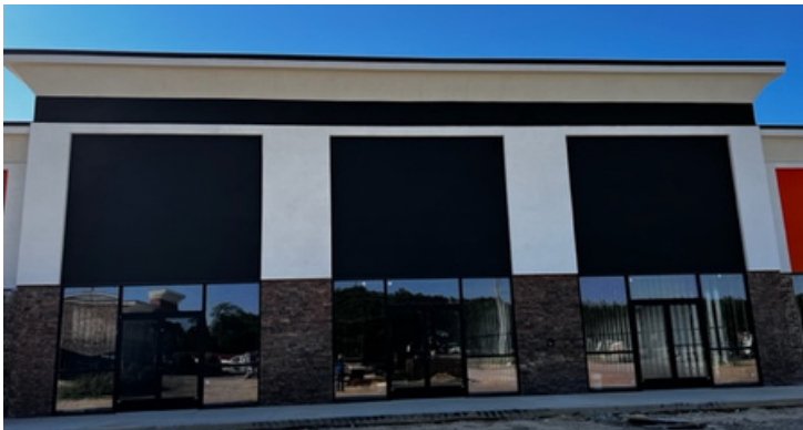
BUILDING 1 | EXTERIOR