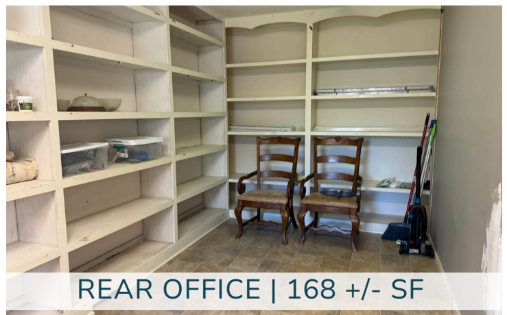
REAR OFFICE | 168 +/- SF

HOLLY BELL NC BROKER C: 910.690.1065 HOLLY@CSGNC.COM