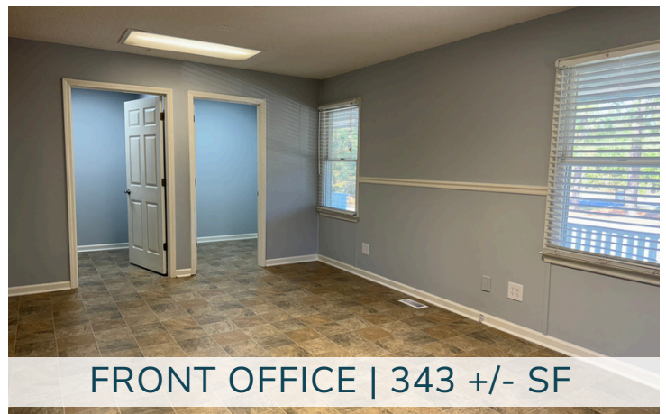
FRONT OFFICE | 343 +/- SF