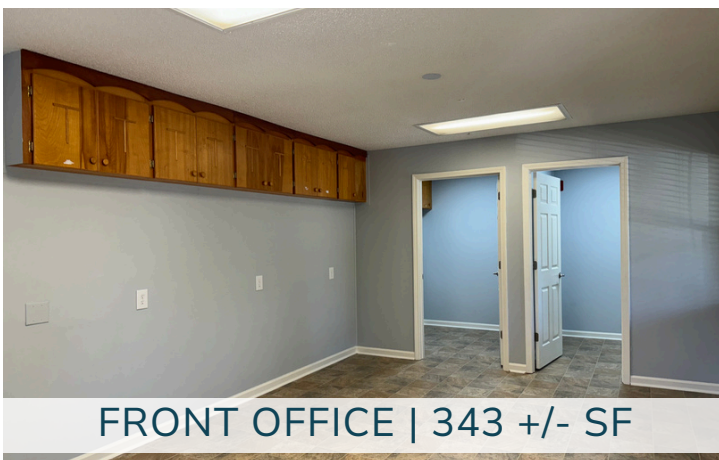
FRONT OFFICE | 343 +/- SF