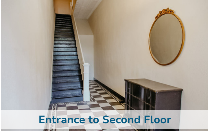
Entrance to Second Floor