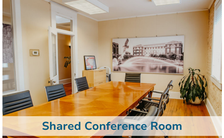
Shared Conference Room