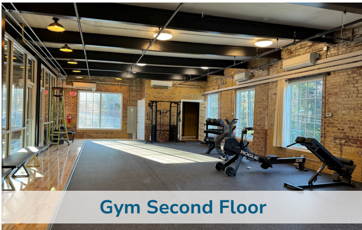
Gym Second Floor