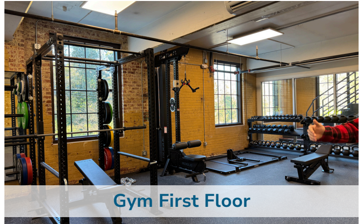
Gym First Floor